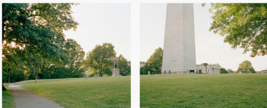
Bunker Hill, 17 de junio de 1775.