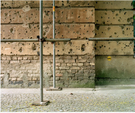
Große Hamburger Straße Scheunenviertel