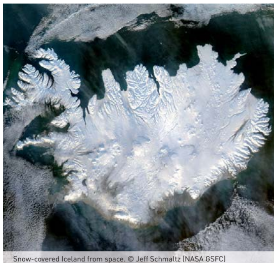
Snow-covered Iceland from space.

The first settlers in Iceland were Vikings that were fleeing the King of Norway's taxes. The first colonist, Ingolfur Arnason, arrived in what is now Reykjavik in 874 and it is well known where his farm was. The Book of Settlers states that the first inhabitants arrived on the island between 874 and 930. Before then, it was considered that Iceland was uninhabitable due to its volcanic nature. Nevertheless, there