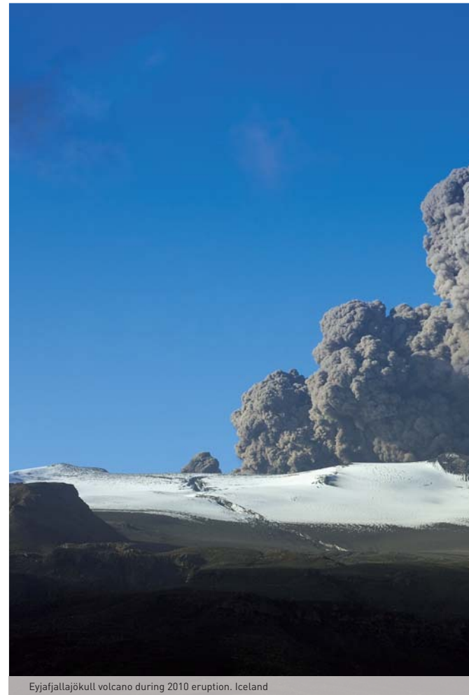
Eyjafjallajökull volcano during 2010 eruption, Iceland

is evidence that some Irish hermits arrived before that date.