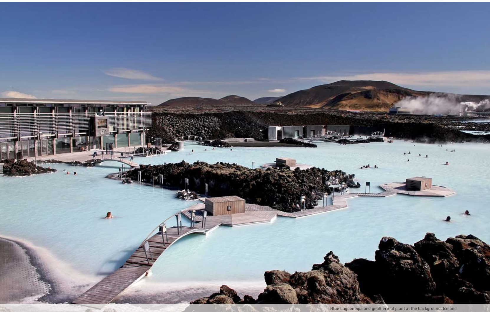
Blue Lagoon Spa and geothermal plant at the background, Iceland

The collapse arrived in 2008 due to a group of bankers and financiers that risked too much and speculated, promising very high interest rates and acting with a casino capitalism mentality. In the end they crashed