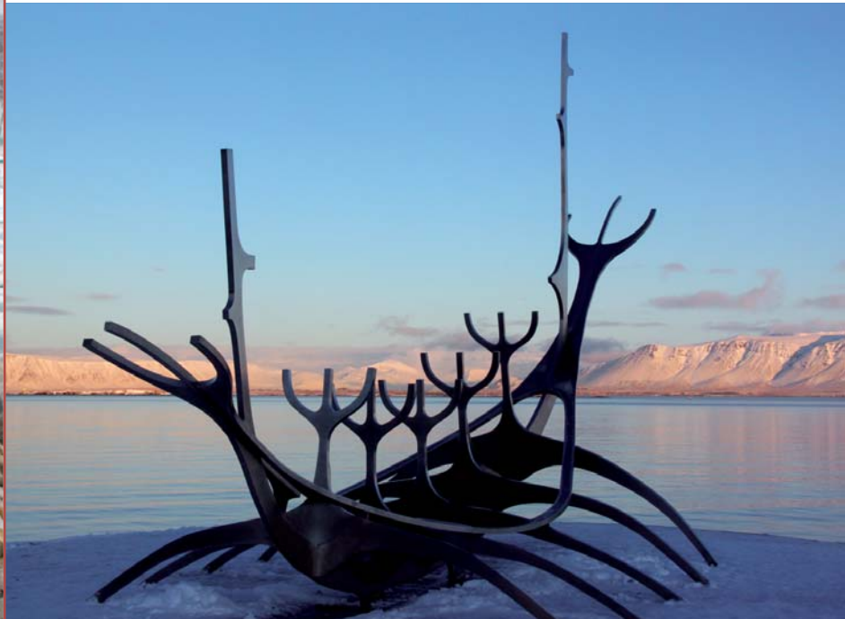
Sculpture Solfar (The Sun Traveller) at Reykjavik, Iceland