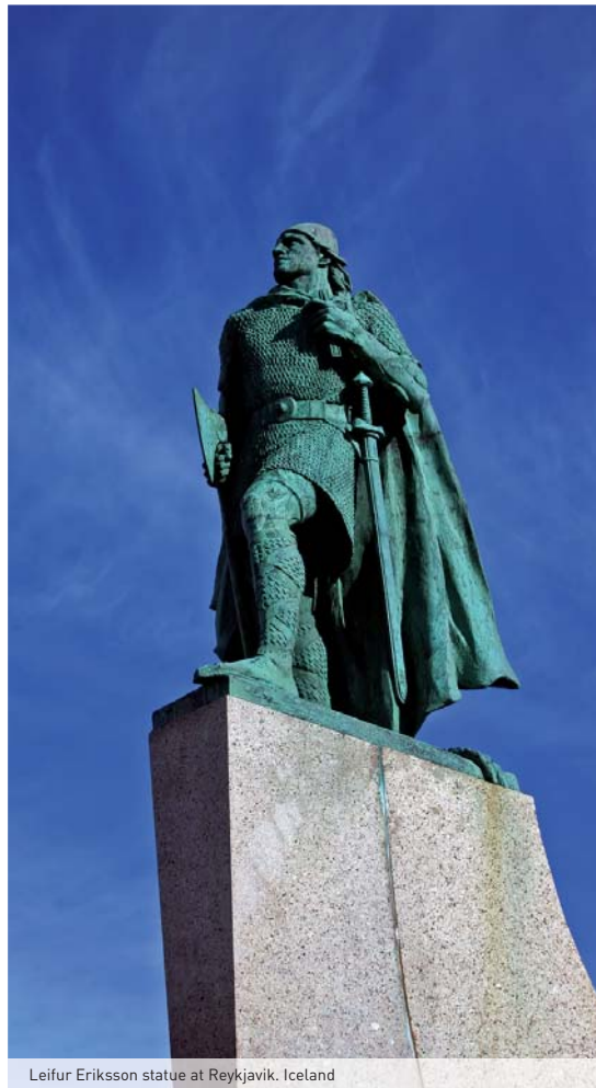
Leifur Eriksson statue at Reykjavik, Iceland

Today's Icelanders have inherited from the old Vikings tenacity, a respect for nature and the refusal to surrender