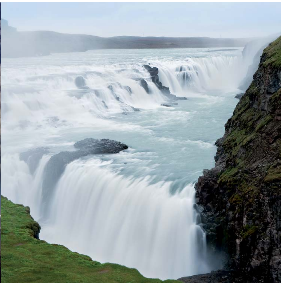
Gullfoss waterfall, Iceland

In Reykjavik, opposite the Cathedral ( Dómkirkjan ), there is a statue of Leifur Eriksson, the first Viking and European to explore the Vinland region, in about the year 1000, which is now part of Terranova and Labrador in Canada. This statue was a gift to the Icelanders from the U.S. in 1930 to commemorate the millennium since the founding of Althing (the Icelandic Parliament). Why do you think that such an important discovery, far before Christopher Columbus' birth, has not transcended to the European history books?