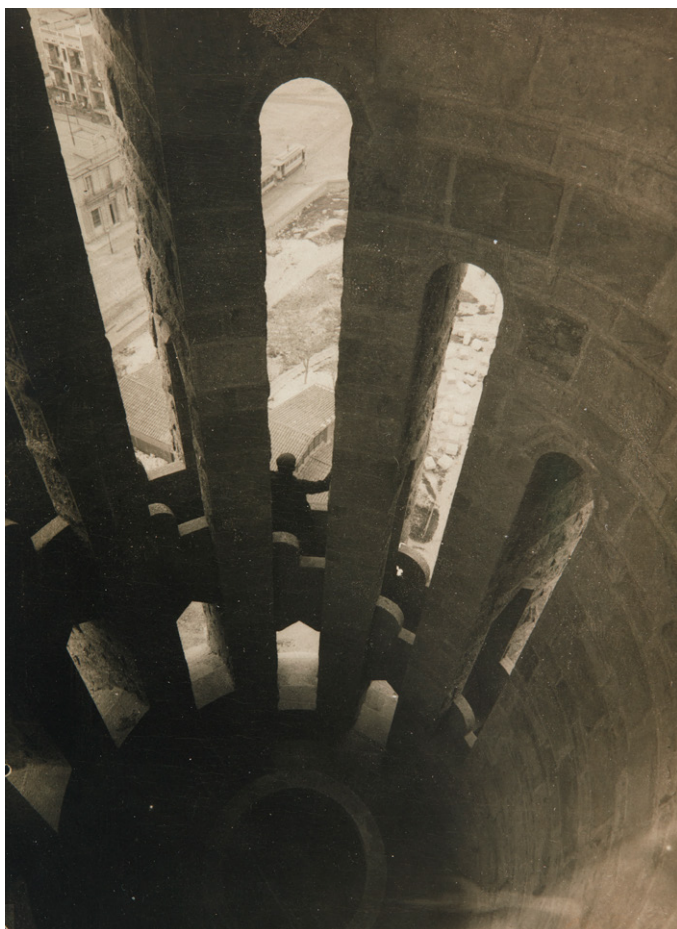
Adolf Mas, Interior of a tower in the Sagrada Família , 1905

The exhibition Adolf Mas. The Eyes of Barcelona offers a broad overview of this key figure of Noucentista photography and includes over 200 photographs and a wide range of documentary material divided into four thematic sections that address the central aspects of his career.