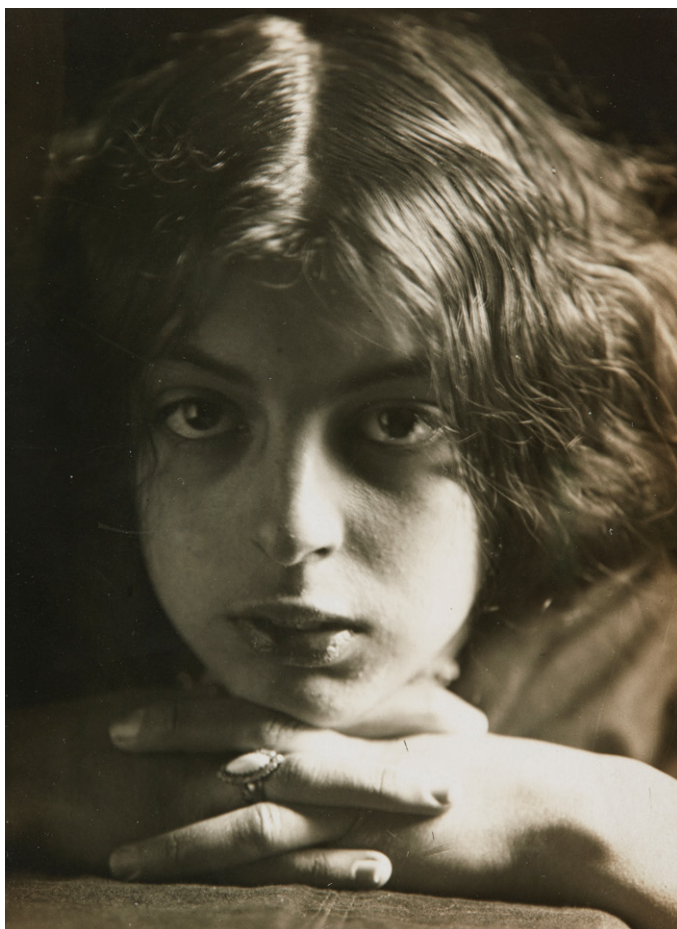
Adolf Mas, Montserrat Blanc , ca. 1909

Adolf Mas. The Eyes of Barcelona is part of the program Fundació MAPFRE has established at KBr Barcelona Photo Center in collaboration with Catalan institutions dedicated to preserving Catalonia's rich photographic heritage. On this occasion, the show has been organized in collaboration with the Fundació Institut Amatller d'Art Hispànic. Likewise, the exhibition has been supported by the Diputació de Barcelona. Arxiu General; the Biblioteca Nacional de Catalunya in Barcelona; the Arxiu Històric de la Ciutat de Barcelona; the Arxiu fotogràfic de Barcelona, Barcelona City Hall; the MAE-Theater Institute; and the private collection of the Pasans Bertolin Family who have all generously loaned their works.