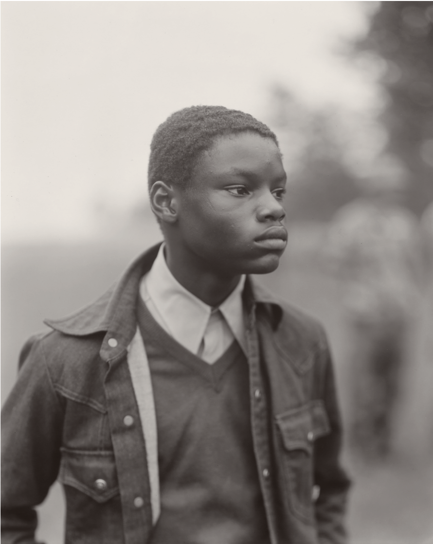
Judith Joy Ross, Untitled, Vietnam Veterans Memorial, Washington, D.C. , 1984