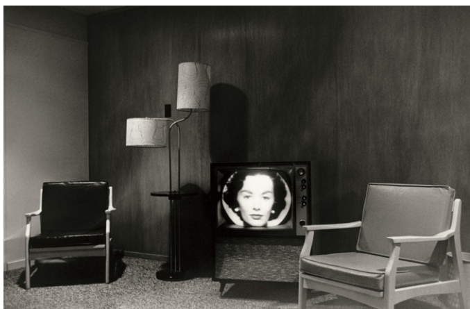
Lee Friedlander, Philadelphia, 1961.

Lee Friedlander once said: “I tend to photograph the things that get in front of my camera” and this is indeed what the artist has done for more than six decades, giving rise to an extremely large and varied body of work which reflects a gaze on the world that is also our own.