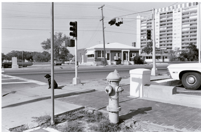
Lee Friedlander, Albuquerque, New Mexico , 1972.

approach to composition are some of the recurring traits that define this artist's particular style and the unique voice that speaks through his images.