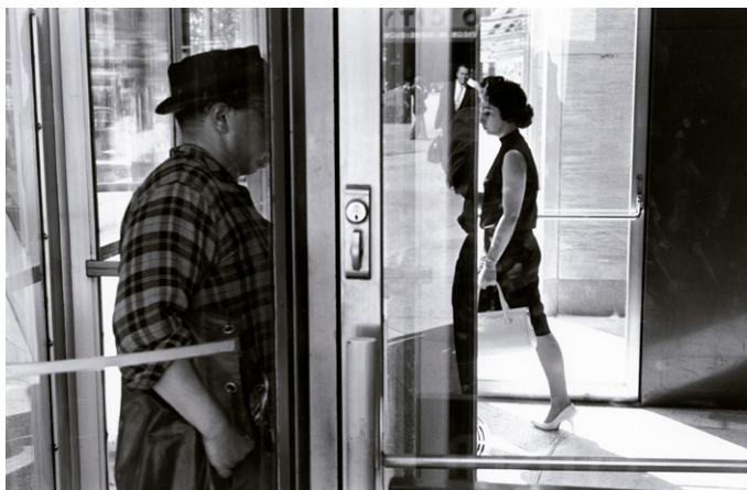
Lee Friedlander, New York , 1963. Courtesy of the artist and Fraenkel Gallery, San Francisco