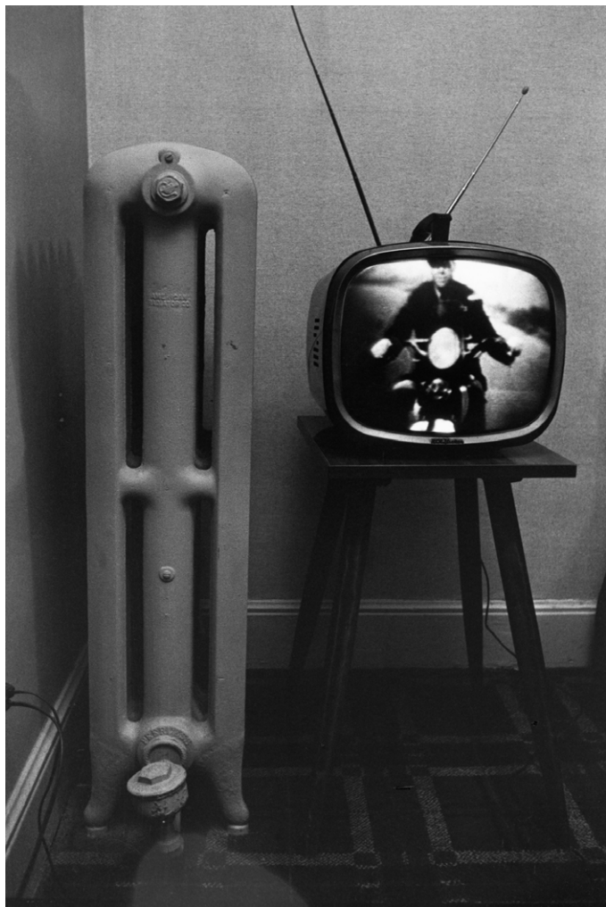
Lee Friedlander, Nashville, 1963.